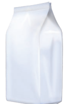
4 Corner Block Bottom Bag