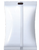
Pillow Bag with Eurohole