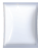
4 Side Seal Bag