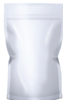
Doy Rim Style Pouch